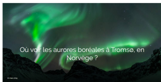
Where to see the northern lights in Tromsø