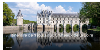
3-day itinerary in the Loire Valley